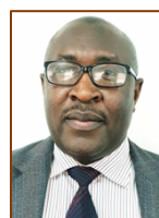
Bala Yusuf Yunusa

Secretary General of the National Commission on Sustainable Development at the Prime Minister's Office, Finland